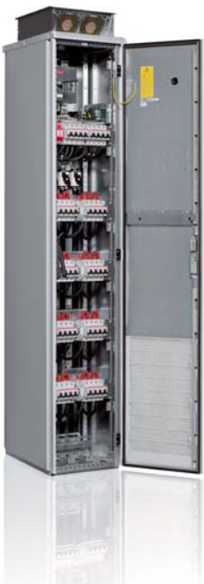
Integrated DC input extension cabinets

© Copyright 2011 ABB. All rights reserved. Specifications subject to change without notice.