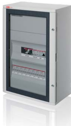
Junction box with monitoring