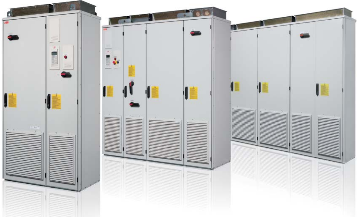
ABB central inverters raise reliability, efficiency and ease on installation to new levels. The inverters are aimed at system integrators and end users who require high performance solar inverters for large photovoltaic power plants and industrial and commercial buildings. The inverters are available from 100 kW up to 500 kW, and are optimized for cost-efficient multi-megawatt power plants.